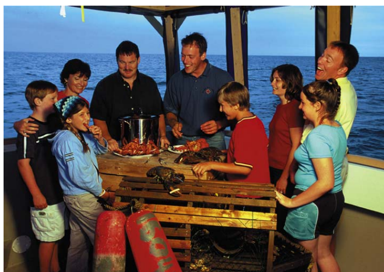
Shediac Bay Cruises, Shediac, New Brunswick Croisières de la baie de Shediac, Shediac, Nouveau-Brunswick