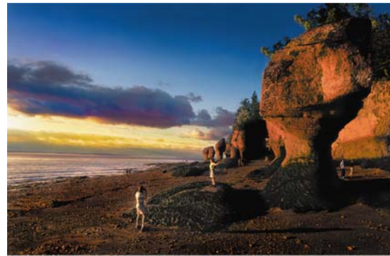
The Hopewell Rocks, Hopewell Cape, New Brunswick Hopewell Rocks, Hopewell Cape, Nouveau-Brunswick