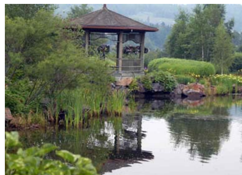
The New Brunswick Botanical Gardens, St. Jacques, New Brunswick Le Jardin Botanique du Nouveau-Brunswick, St-Jacques, Nouveau-Brunswick