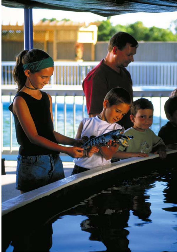
Aquarium and Marine Centre, Shippagan, New Brunswick Aquarium et Centre marin, Shippagan, Nouveau-Brunswick

The TradeSmart Program was designed, in partnership, by the Province of New Brunswick and The Economic Planning Group of Canada, with the assistance of two of Canada's leading tour operators. This innovative, leading edge initiative has been very effective in advancing the travel trade market-readiness of the province's tourism suppliers. New Brunswick, Canada has been promoting its TradeSmart certified suppliers since 1999. Nova Scotia joined the program in 2001.