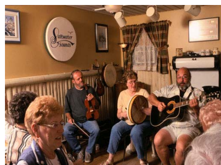
The Miramichi Kitchen Party, Miramichi, New Brunswick Miramichi Kitchen Party, Miramichi, Nouveau-Brunswick