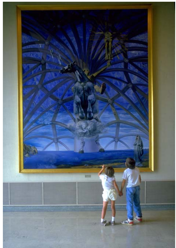
Beaverbrook Art Gallery, Fredericton, New Brunswick Galerie d'art Beaverbrook, Fredericton, Nouveau-Brunswick