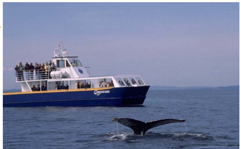
Quoddy Link Marine Whale-watching, Bay of Fundy, New Brunswick Observation de baleines, baie de Fundy, Nouveau-Brunswick

The Economic Planning Group of Canada, as manager of the TradeSmart program, does not monitor or audit TradeSmart Certified Suppliers. Approval and/or participation in the TradeSmart Program is based on information provided by individual suppliers. Compliance with regulatory requirements and good practices rests with the individual suppliers. The Economic Planning Group of Canada accepts no liability related to the performance or non-performance of TradeSmart Certified Suppliers.