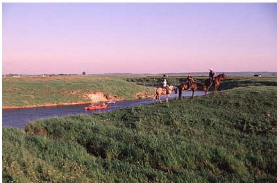
Broadleaf Guest Ranch, Hopewell Hill, New Brunswick Broadleaf Guest Ranch, Hopewell Hill, Nouveau-Brunswick