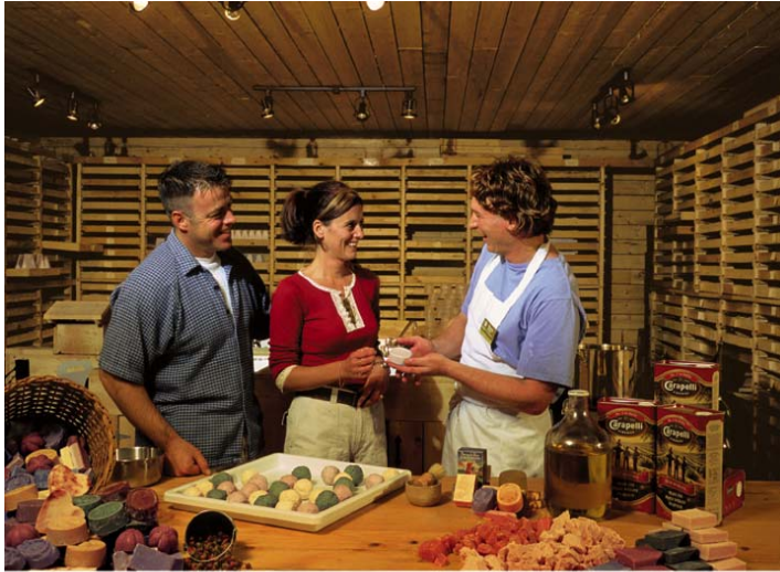
The Olivier Soapery, Canada's Soap Ecomuseum™, Sainte-Anne-de-Kent, New Brunswick La Savonnerie Olivier, Économusée du savon du Canada™, Sainte-Anne-de-Kent, Nouveau-Brunswick